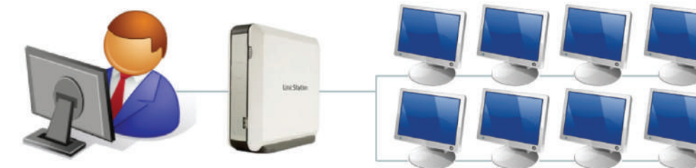
Human Resources/IT Smart Trainer - Full of Knowledge